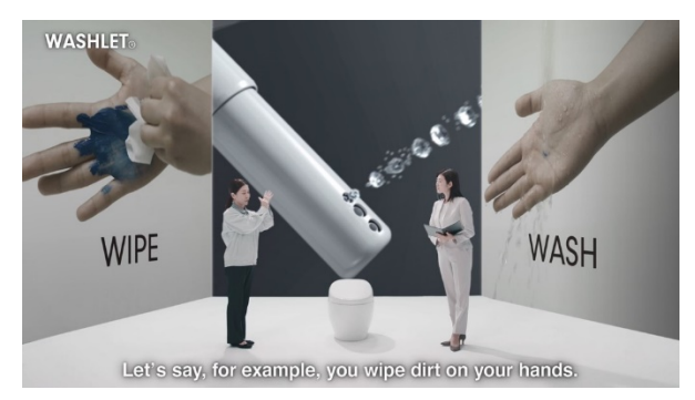
From the CES2021 presentation video

They also introduced their specialties in washing technology, with AIR - IN WONDER - WAVE, which achieves strong and thorough cleaning with minimal water, as well as seat warming and deodorizing functions to allow for comfortable toilet use.