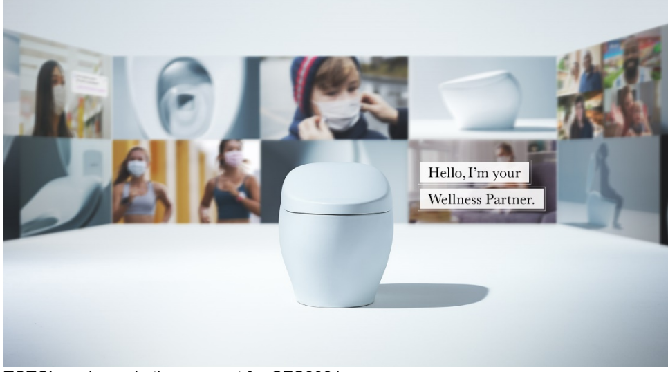
TOTO's main marketing concept for CES2021

At the event, TOTO presented the TOTO CLEANOVATION message, which states that TOTO's technological innovations that contribute towards hygienic, clean, and comfortable lifestyles will spread throughout the world as it has done for a century as a toilet and plumbing equipment manufacturer since its founding in 1917. TOTO also announced the Wellness Toilet initiative for the first time, aiming to make health into a new lifestyle value, with "Hello, I'm your Wellness Partner" as the concept for the event.