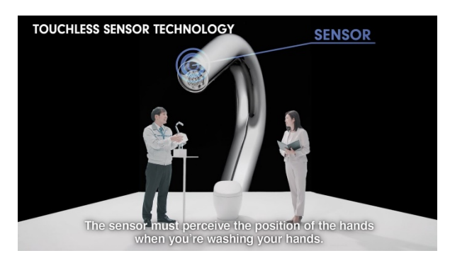
From the CES2021 presentation video

TOTO began sales of automatic faucets in 1984. Initially, sensors were in the body of the faucet, but they didn't detect hands well and malfunctions occurred. Taking on the challenge of shrinking the sensors, TOTO worked on a sensor for the tip of the faucet where the water comes out. Sales began in 2001 of automatic faucets where water would come out just by extending the hand toward the faucet.