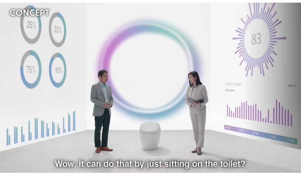
From the CES2021 presentation video

TOTO, which celebrated its 100 year anniversary in 2017, is actively promoting digital innovation to continue to lead the industry for the next 100 years. TOTO is partnering with global startups and research organizations in open innovation, advancing the development of completely new plumbing products.