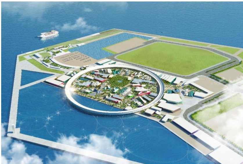
Conceptual rendering of venue

* WASHLET is a registered trademark of TOTO LTD