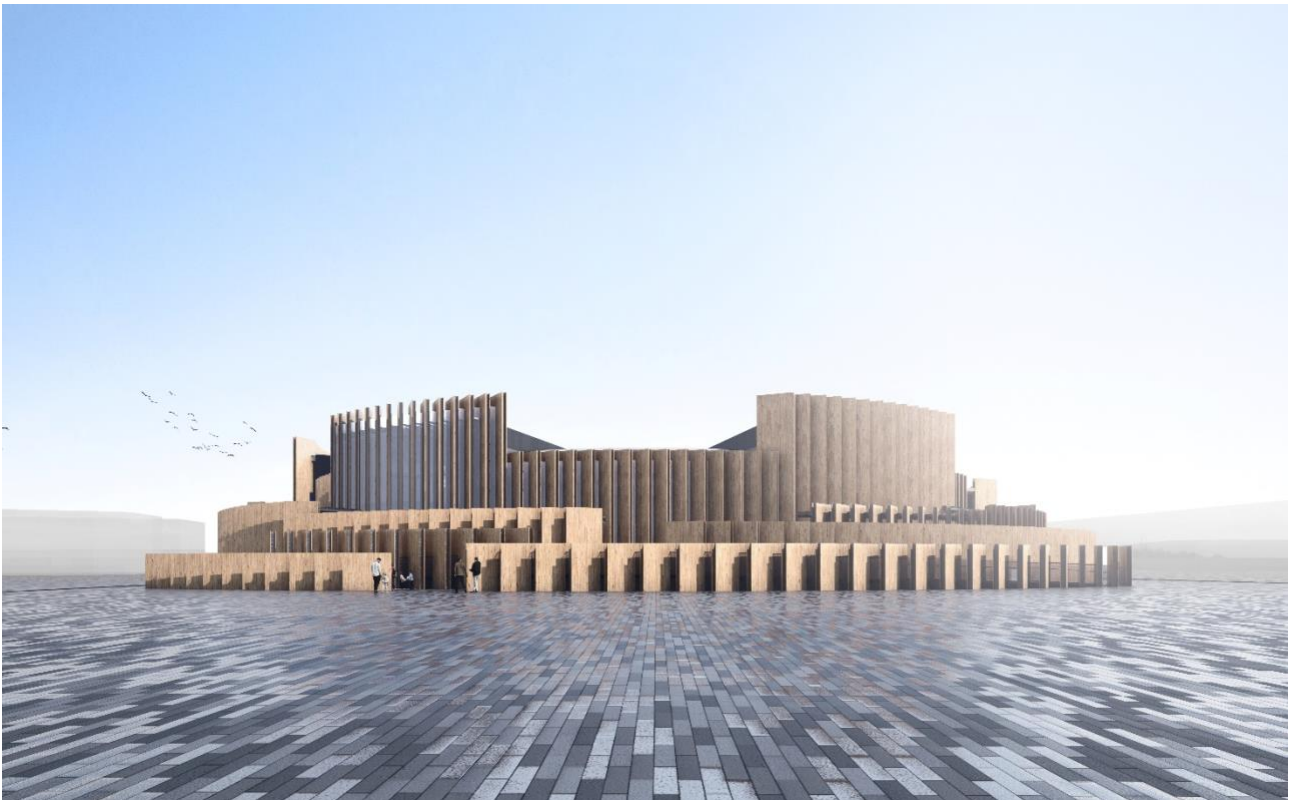
Conceptual exterior view of the Japan Pavilion

* WASHLET is a registered trademark of TOTO LTD.